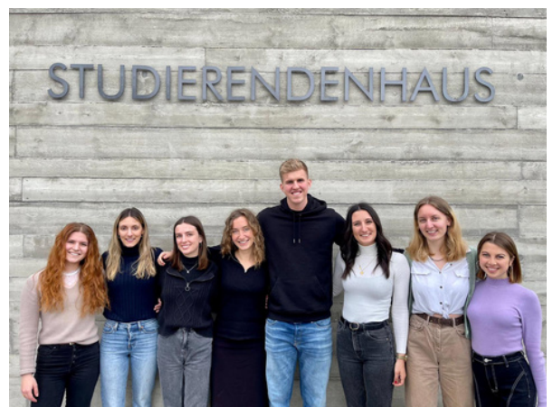
The Board of Directors of IRM network e.V.