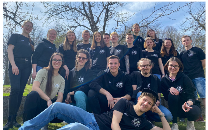
Die Fachschaft ANK